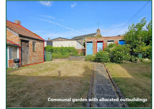
Communal garden with allocated outbuildings